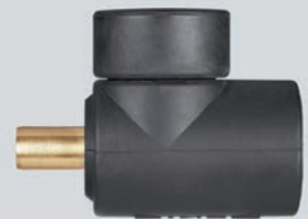
Cable Joint Socket DIX KAB 70/95