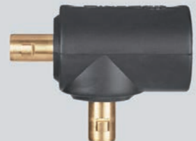
Cable Joint Plug DIX KAS 70/95