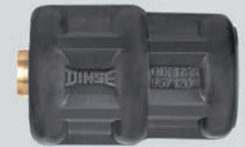
Reduction Plug DIX RSS 95/120