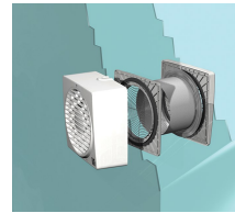
KIT FF 300/12" (DOUBLE OPEN.WINDOW KIT) Code 13026