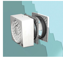
KIT VV 300/12"/DOUBLE OPEN.WIND.SEC.GLASS Code 13023