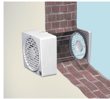
KIT MU (WALL-MOUNTING KIT) Code 13018