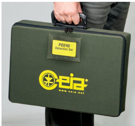
PD240 HAND HELD DETECTION SET WITH CARRY BAG