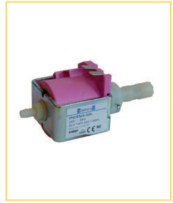
Proven sealing system for reliable and long life application